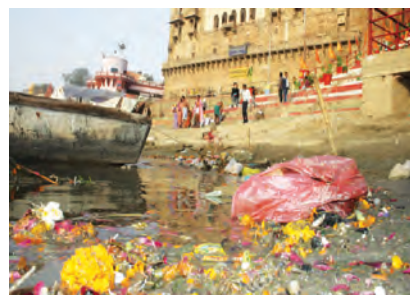
18.6 Diminution of ecosystem

Humans are the consumers in an ecosystem. Ecosystems can provide basic needs in normal conditions, but due to increased population, man kept on snatching natural resources on large scale. Changing life style demands 'more' than 'necessary'. That has increased stress on the ecosystems and has generated vast amount of wastes.